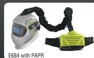
E684 with PAPR

Ultimate protection with maximum comfort!