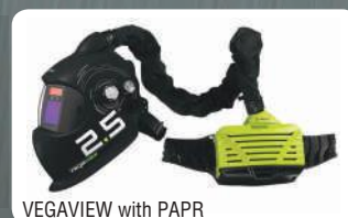
VEGAVIEW with PAPR