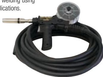
SUREGRIP SP24 200 AMP