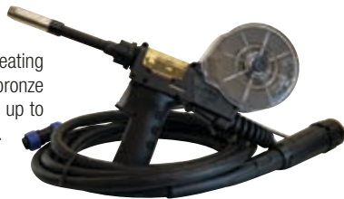
SUREGRIP SP15 150 AMP

$785.00 Including GST $682.61 excluding GST XASP15-24-P1-60ER